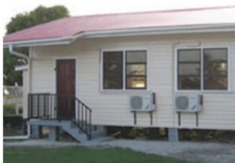
The I-TECH Guyana office is located in the Health Sciences Education Unit of the Ministry of Health, which aids in collaboration.

Guyana National Training Coordination Centre (GYNTCC). The Ministry established the GYNTCC to address the need for standardized national pre-service and in-service HIV and AIDS curricula, and the ability to coordinate and track all HIV-related training to ensure a well-prepared HIV workforce.